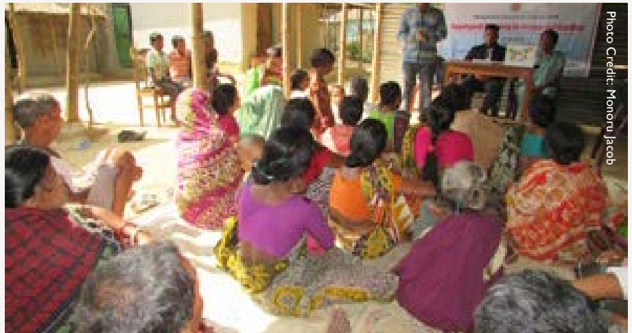
Courtyard meeting with tea garden workers