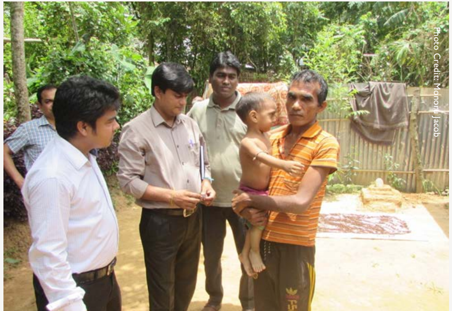
Active screening of indigenous community

The Global Health Bureau, Office of Health, Infectious Disease and Nutrition (HIDN), US Agency for International Development, financially supports this publication through Challenge TB under the terms of Agreement No. AID-OAA-A-14-00029 This publication is made possible by the generous support of the American people through the United States Agency for International Development (USAID). The contents are the responsibility of Challenge TB and do not necessarily reflect the views of USAID or the United States Government.